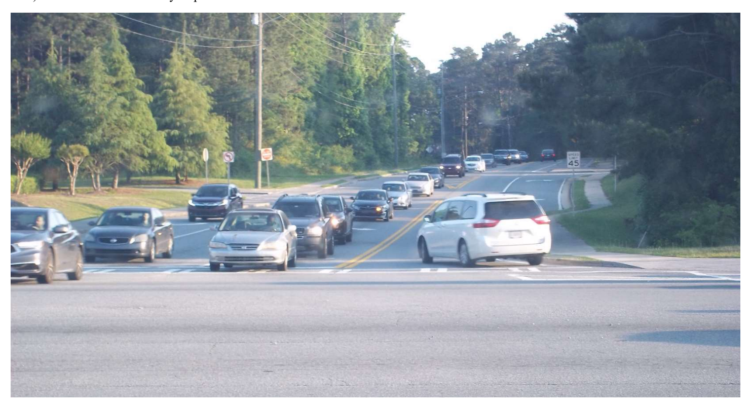
Reference Point D – View looking west at current intersection of Kroger plaza access road and John Ward Rd. Though there is a clearly marked 'no left turn' sign vehicles often disregard and turn left anyway. Residents of this proposed residential development who need to access Powder Springs Road will be forced to meander through the Kroger parking lot which currently is not clearly designed to handle this type of traffic.

Reference Point C – View looking north down John Ward Road at intersection of Macland Road around 7:50am on a weekday. Again, the cars that are lined up on John Ward Rd. make a left-hand turn from the Kroger plaza access road(upper right beyond decel lane) onto John Ward virtually impossible.