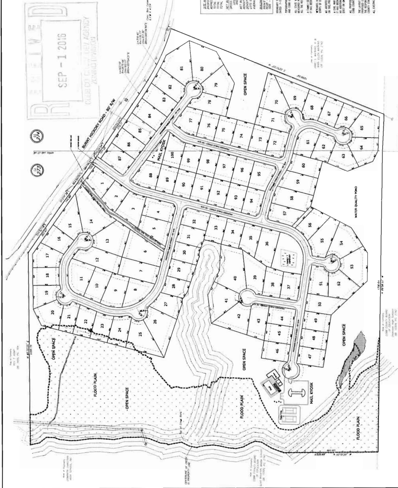
GRAPHIC SCALE 1" = 100' 3" = 300'

SEP - 1 2016 CLERK OF SUPERIOR COURT JUDICIAL DIVISION