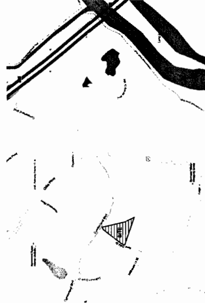
1 VICINITY PLAN

SITE DATA: CUMBERLAND BLVD BUILDING DATA 6 STORY BUILDING 6 STORY PARKING DECK RESIDENTIAL DATA 7,500 RETAIL/OFFICE SF 220,125 TOTAL NET RENTABLE SF UNIT DATA MIN SF 700 RANGING UP TO 1400 SF PARKING DATA PARKING SPACES REQUIRED MINIMUM: RESIDENTIAL: 259 UNITS x 1.75 PER UNIT = 453 MIN. PARKING SPACES PROVIDED: 510 SPACES PROVIDED IN 6 LEVEL DECK