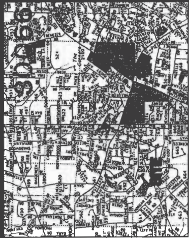
LOCATION MAP SCALE 1" = 2000'

NOTES: 1. SURVEY NOTES HAS BEEN CALCULATED FOR CLOSURE AND HAS BEEN FOUND TO BE ACCURATE WITHIN 1 FOOT IN 411,901 FEET. 2. THE FIELD DATA UPON WHICH THIS PLAT IS BASED HAS A MEAN ANGLE ERROR OF 08" PER ANGLE AND WAS ADJUSTED USING THE COMPASS RULE. 3. I HAVE THIS DATE EXAMINED THE COBB COUNTY GIS HAZARD MAP COMMUNITY NUMBER 130062, PANEL 00-44G, DATED 12-16-2008, AND HAVE DETERMINED THAT THIS PROPERTY IS NOT LOCATED IN AN AREA HAVING SPECIAL FLOOD HAZARDS.